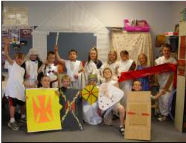
3rd graders show off their projects and their knowledge of ancient Roman culture

On June 1, 2007, third graders at Springdale Elementary visited ancient Rome. Students dressed in tunics, stollas, and togas to act out, sing about, or report on ancient Rome. This event was the culmination of weeks of research by third grade students on the people, places and events of ancient Rome. Parents and siblings were impressed by the knowledge that these students had gained about ancient Rome. We all enjoyed the typical Roman foods as a snack. Third graders said that they will remember this for a long time.